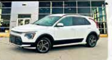
2025 Kia Niro EX

$36,695 OR $132/wk + HST & lic STOCK #: P22701 LOW KMS - 9,003 KM