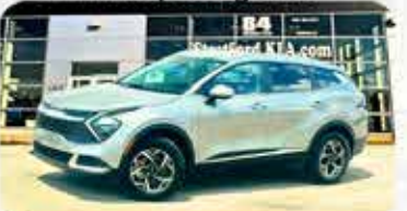
2024 Kia Sportage LX

$26,795 OR $96/wk + HST & lic STOCK #: P22718 MILEAGE - 78,967 KM