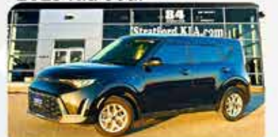
2023 Kia Soul

$23,995 OR $86/wk + HST & lic LOW KMS - 54,000 KM STOCK #: S26352A