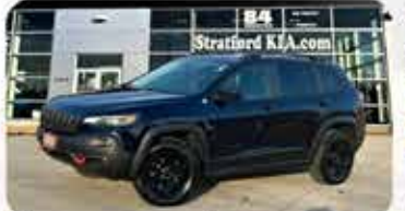
2021 Jeep Cherokee Trailhawk Elite

$26,995 OR $97/wk + HST & lic STOCK #: P22708 MILEAGE - 75,200 KM