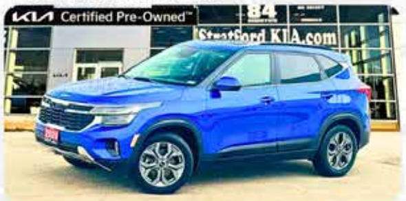
2024 Kia Seltos EX

$26,795 OR $96/wk + HST & lic STOCK #: P22709 LOW KMS - 67,389 KM