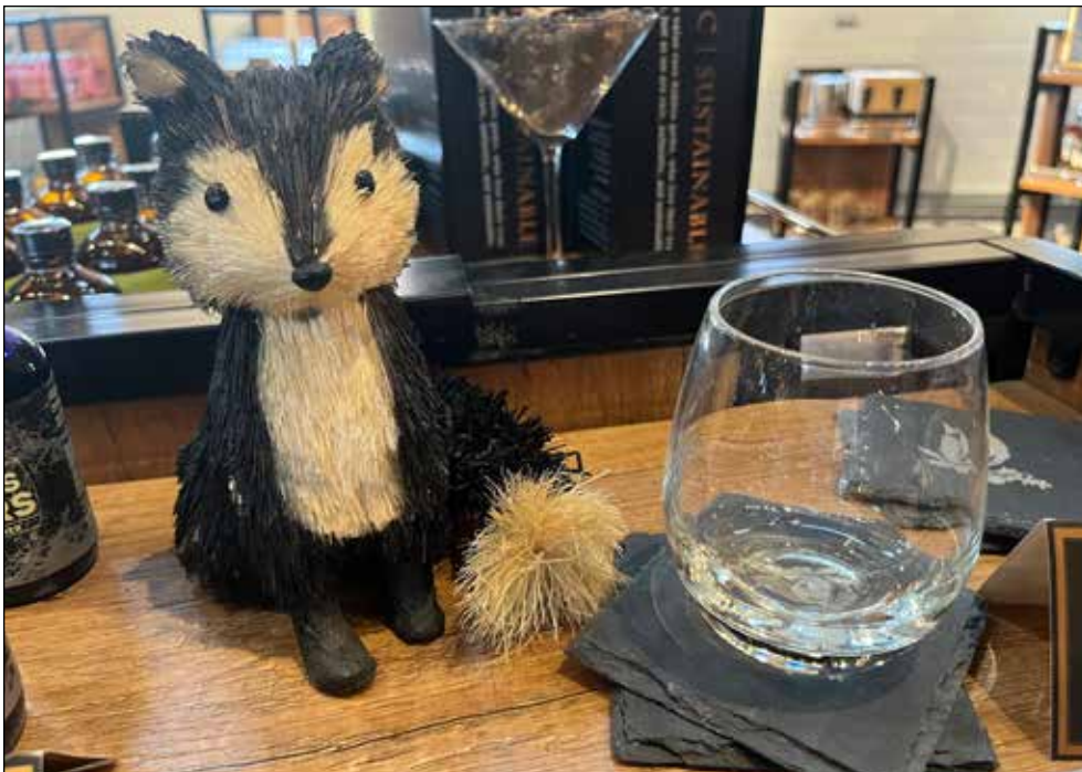
Remembering the original black fox, which inspired the name of the distillery.