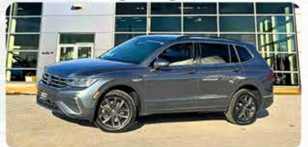
2022 Volkswagen Tiguan Comfortline

$24,295 OR $87/wk + HST & lic STOCK #: DS26302A MILEAGE - 96,403 KM