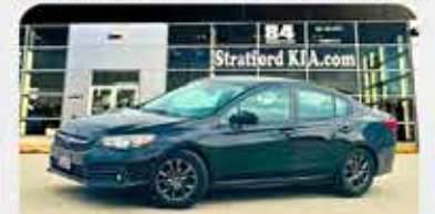
2022 Subaru Impreza Convenience

$21,695 OR $78/wk + HST & lic LOW KMS - 66,017 KM STOCK #: P22710