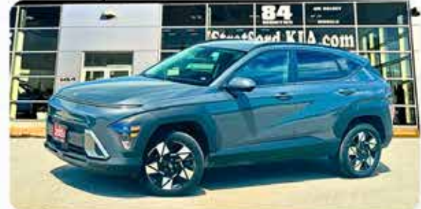
2024 Hyundai Kona Preferred

$25,495 OR $92/wk + HST & lic STOCK #: P22717 MILEAGE - 85,813 KM