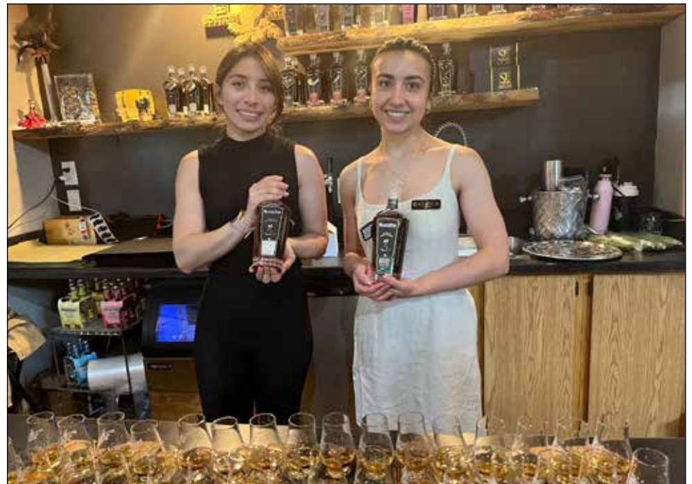
Black Fox staffers ready to make some whisky-loving customers very happy.