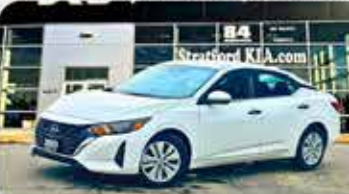
2025 Nissan Sentra S Plus

$21,295 OR $76/wk + HST & lic LOW KMS - 15,304 KM STOCK #: P22644