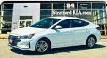
2019 Hyundai Elantra Preferred

$14,795 OR $53/wk + HST & lic LOW KMS - 79,819 KM STOCK #: DS26321A