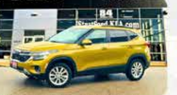
2024 Kia Seltos EX Premium

$29,495 OR $106/wk + HST & lic STOCK #: P22705 LOW KMS - 41,626 KM