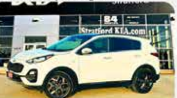
2021 Kia Sportage EX

$22,495 OR $81/wk + HST & lic LOW KMS - 79,923 KM STOCK #: S26308A