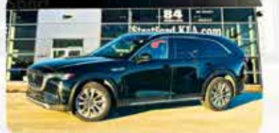
2024 Mazda CX-90 MHEV GT-P

$37,695 OR $135/wk + HST & lic STOCK #: P22680 LOW KMS - 88,793 KM