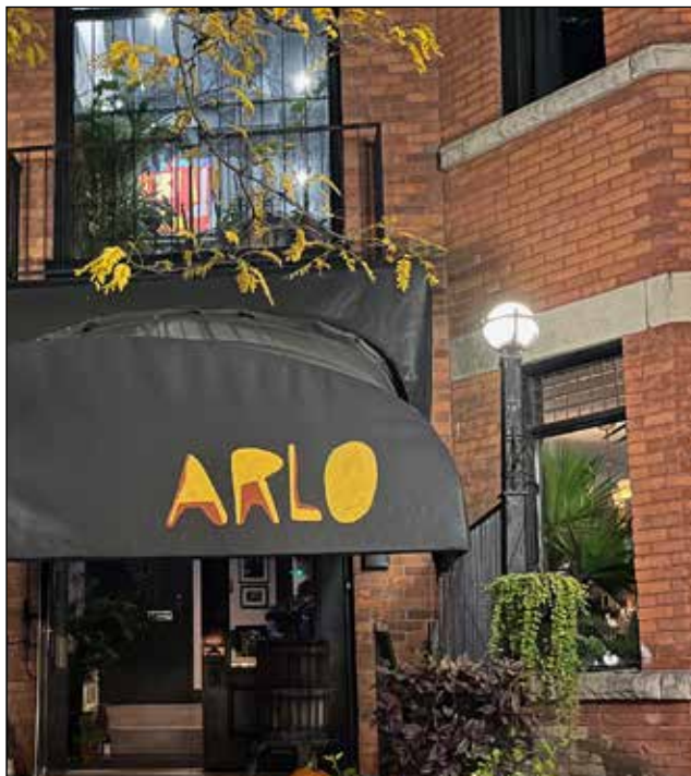
At Arlo, it's all about food and conversation – no one was on their phone!