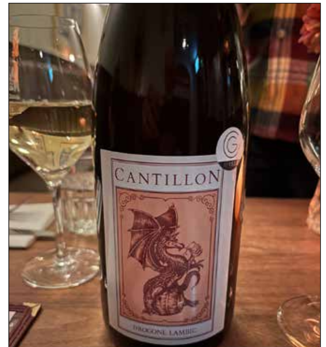
The manager at Arlo had brought in a special beer just for this writer!