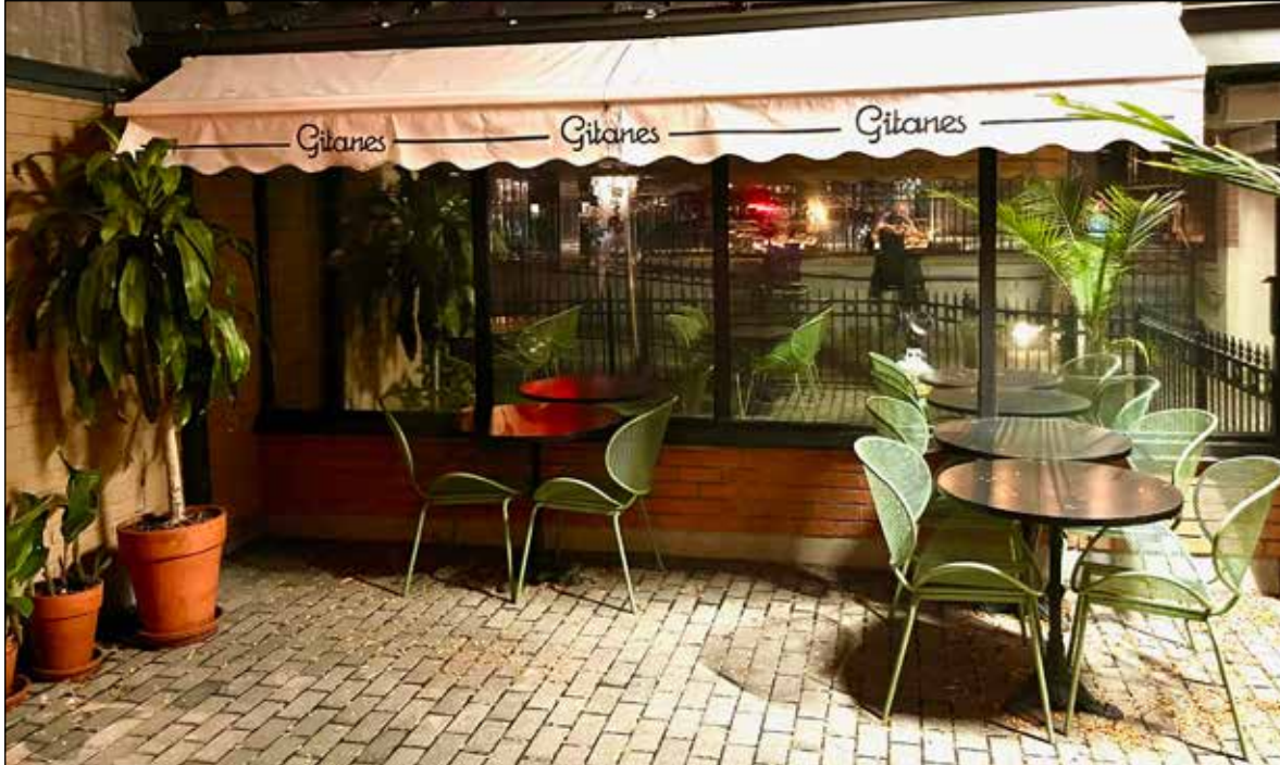
Gitanes features French cuisine using local ingredients.

The Gitanes experience is defined as "fine French dining in